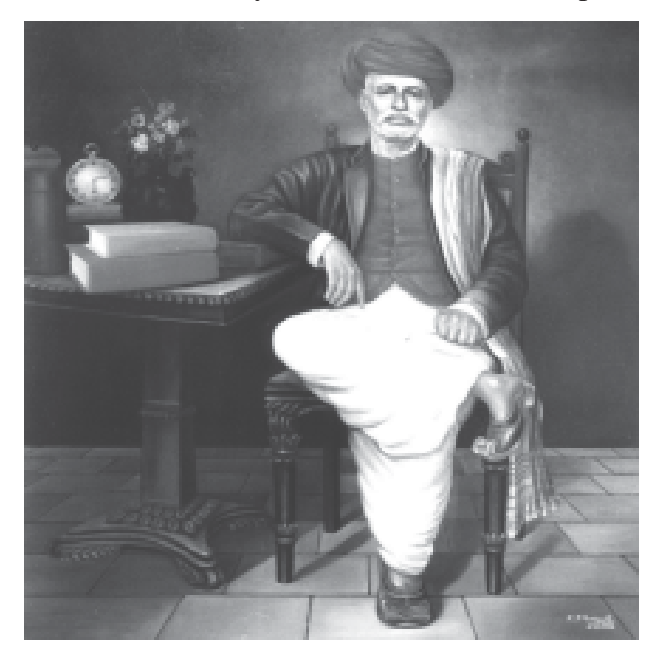
Fig. 3. Mahatma Jyotiba Phule

is based on the sold foundation provided by research, it is merely a house built on sand"<sup>16</sup>. However, it was towards the end of 19th Century and beginning of 20th Century that the foundation for Agricultural Education was laid in India with the establishment of six Agricultural stations and Colleges at Lahore (Lyallpur), Kanpur (1893), Nagpur (1906), Poona and Coimbatore (1907) and Sabore (1908). At Poona, the Department of Agriculture was established in 1877 followed by setting of similar departments by the provinces. It was soon realized that research and education were the very foundations for the development of agriculture.