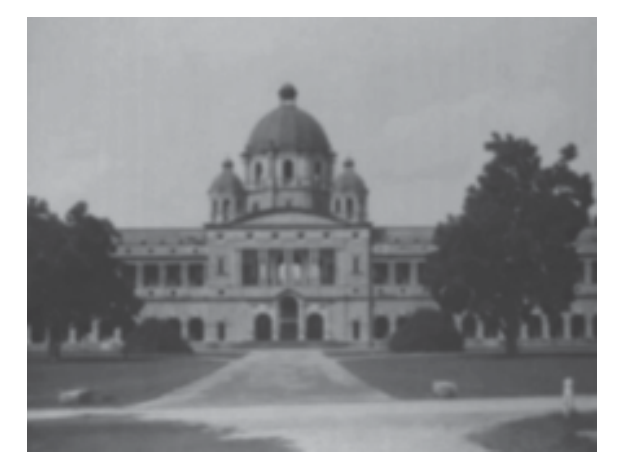
Fig. 2. Imperial Agricultural Research Institute at Pusa (Bihar)

and establish a research institute. In 1892, the Imperial scientists met at an open site in Pusa, a sleepy village in Bihar about 50 miles north of Patna. This site had been with the Government for a long time having been acquired cheaply due to a privately owned but failed indigo and tobacco plantation, and now Lord Curzon had big plans for its use. An American philanthropist and a friend of Curzon's wife, Henry Phipps (Fig. 1) had visited the couple from Pennsylvania, USA for attending the ceremony in India associated with the coronation of King Edward. Phipps gave Lord Curzon an unrestricted grant of US$30,000 and with it Curzon decided to build a Research Institute at Pusa. In 1905, the Imperial (now Indian) Agricultural Research Institute (IARI) was established at Pusa (Bihar) (Fig.2)