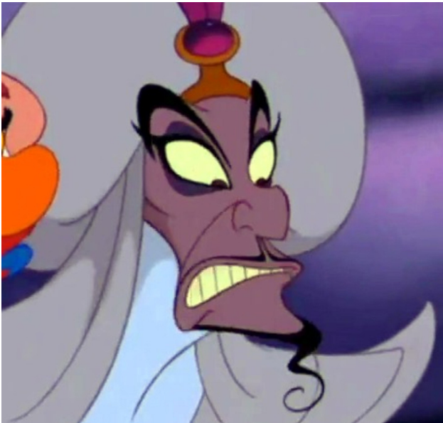
Fig. 6. Disney's Jafar, the evil vizier. Aladdin , 1992

Fig. 5 shows how the family generations of Barmakids and Baghdad Caliphs were imbricated. The historical memory of this multi-generational collaboration between Caliphs and Barmakids became the stuff of legend and is transmitted, through The One Thousand and One Nights even to the present, in the figure of Walt Disney's Jafar, the evil magician and vizier appearing in the 1992 film Aladdin (Fig. 6). 14