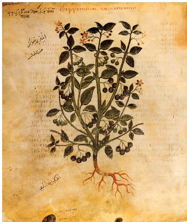
Fig. 3. A page from the Vienna Dioscorides MS, 512 CE. Solanum nigrum : Black Nightshade.

However, in spite of the evident opportunities for cultural exchange, detailed comparisons of Hippocratic and Ayurvedic