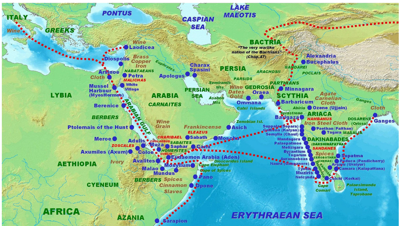
Fig. 2. Roman trade in the subcontinent according to the Periplus Maris Erythraei , 1st century CE