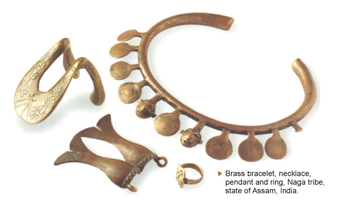
Figure 4 Ornaments of old times used by Naga tribes.

importance right from pre-Rigvedic to the first half of 20th century has been described by Chakrabarti (1976, 1992) and Vaish et al. (2000). Even the Damascus Sword was prepared with indigenous steel making technology. These records offer a comprehensive synthesis of the geological, archaeological, metallographic, literary and ethnographic data on early iron in India, but very limited on ore extraction e.g. the book titled The beginning of iron in India- Antiquity seems important in showing the antiquity of Indian steel-making, examining literary sources and throwing light on the use of iron but not on excavation aspects (Chakrabarti 1976).