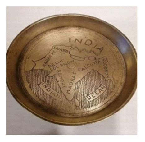
Figure 1 Bronze utensils of 1867.

plored by the ancient miners, and had been worked to considerable depths. At Hutti, for example, narrow gold reefs were worked by ancients to a length of some 1500 m and to a depth of 190 m by fire-setting alone. The active mining for reef gold was going on in many of the goldfields of southern India, such as Bellari, Kabligatti, Waynad and elsewhere, during the reign of Vijayanagar Kings (1336– 1560) and later during the regime of King Tipu Sultan. Kolar Gold Field (KGF) is a historical mining landscape/ region which had produced tonnes and tonnes of gold by Bharat Gold Mines Limited (BGML) formerly called as Bharat Earth Movers Limited or BEML (Figure 2).